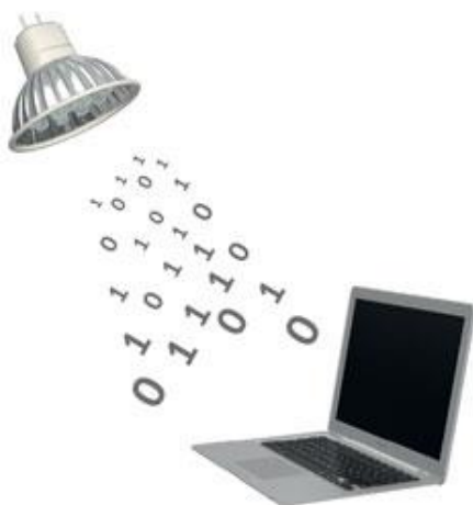
Figure 2. Data transmission in Li-Fi Technology

The affordable, speed change in the optical form of Wi-Fi is the Li-Fi and it is based on Visible Light Communication i.e. Visible Light Communication where VLC is a medium of information communication which avails quick pulses of light to send the data wirelessly. If the LED is on, a digital string '1' is transmitted and when the LED is off then a digital string '0' is transmitted. For example, there is a LED at one end and a photo detector at the other end, whenever the LED is on, a binary '1' and when the LED is off a binary '0' is registered by the photo detector. Thus a message is build up by many flashes of LED. There is Many highly developed technologies can be used in ship navigations. Li-Fi increasing the data rate of VLC, a recent research in Berlin attained rates of 500 megabytes per second. Parallel data transmission where each LED generates a separate data stream and has been focusing on many teams in the University of Oxford and Edinburg.